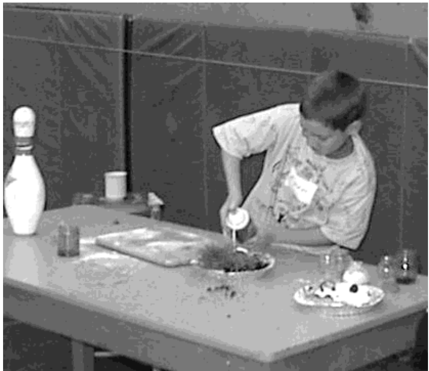
Making Enemy Pie!