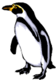
A penguin holding its breath!

What is red and white and black all over?