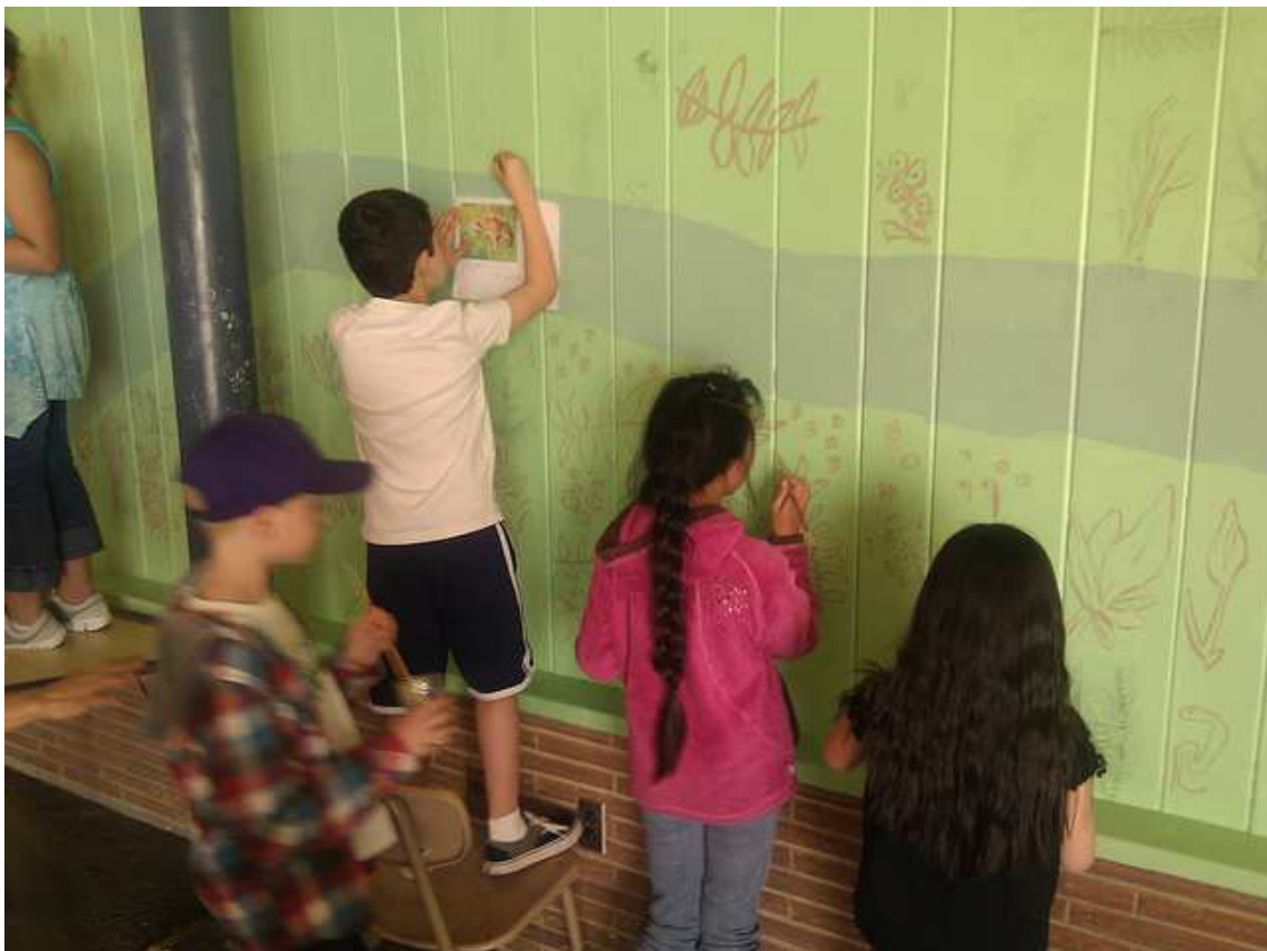
Room 9 drawing and painting on the playcourt mural

We just went to the zoo. We do math a minute, and we did the MSP test. We also just did the MAP test. Room 9 outlined the pictures in the playcourt and drew them in. The plants have lots of details. We are working with Mrs. Andersen.