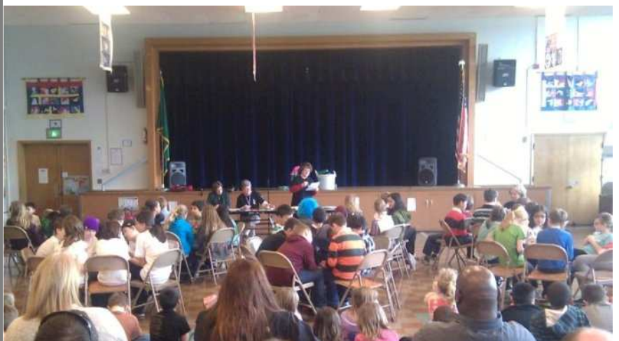
Global Reading Challenge!